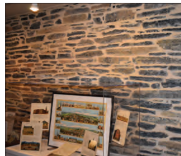
Heritage Frederick received a grant that supported crucial repointing of stone walls that support the building.