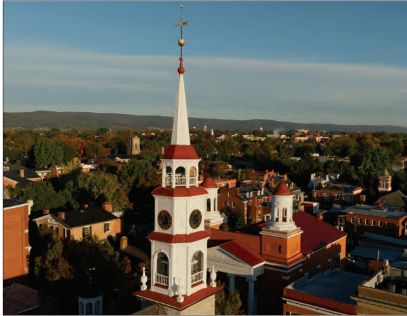
Evangelical Reformed United Church of Christ's Trinity Chapel.