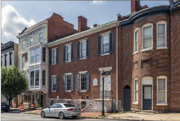
Washington County Historical Society

“This project had a truly significant and lasting impact on the Miller House Museum in perpetuity. In addition to finally supplying HVAC to the only two remaining unheated rooms in the museum, this project assures that the artifacts and documents stored in these rooms will now be in a climate controlled setting, and they will no longer continue to be harmed or damaged by the excessive humidity and cold they have been subjected to in the past. This project has helped WCHS and the Miller House Museum be better stewards of our artifact collection.”