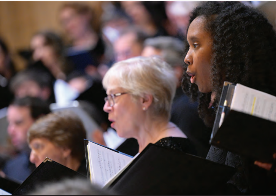
Frederick Chorale Collaboration Concert