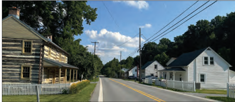
The study, funded by Delaplaine Foundation, showed the need for traffic calming measures to be implemented by Maryland SHA on Rte. 806 intersecting Catoctin Furnace Village.