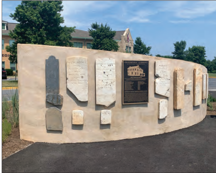
Cemetery headstones preserved by Saint Katharine Drexel Church