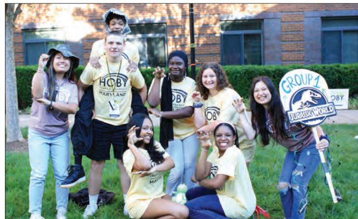
HOBV 2024 Maryland Leadership Seminar Foundation participants