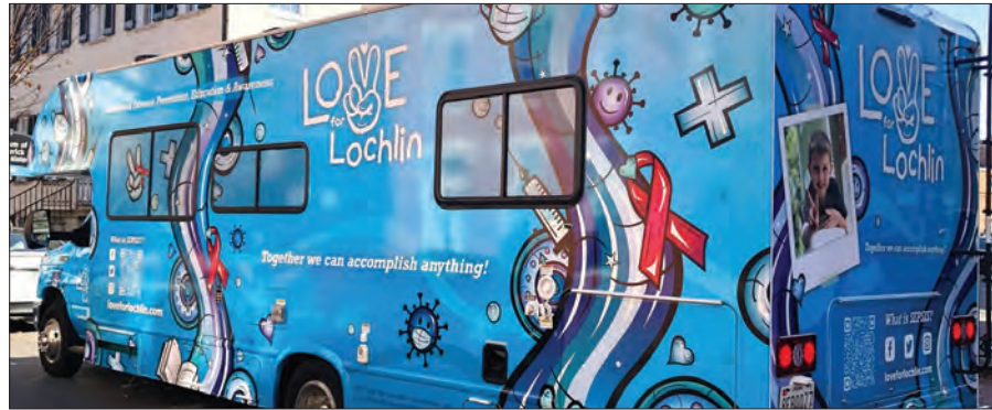
Love for Lochlin Foundation mobile vaccination clinic