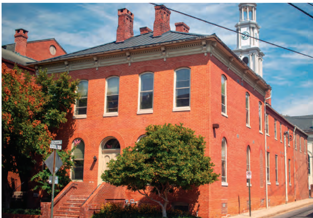
Phoenix Recovery Academy, Maryland's only school for teens that are rebounding from substance abuse, is located in downtown Frederick and in its third year of operation. Courtesy photo.