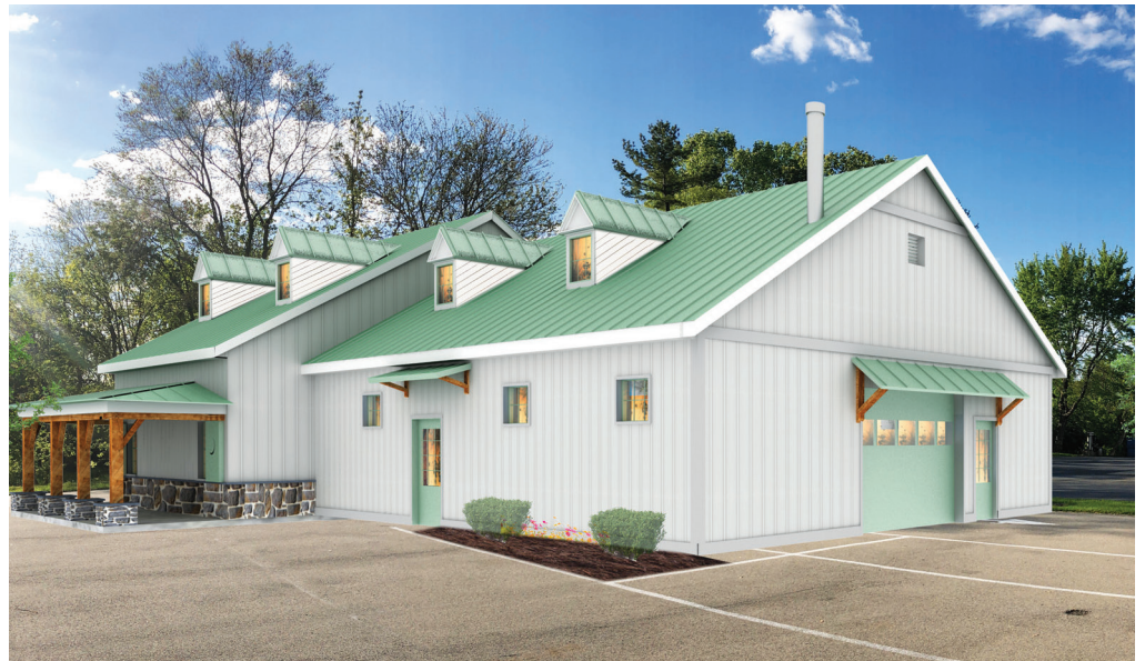
Rendering of William F. Moran, Jr. Forging and Educational Facility, to be located in Middletown.