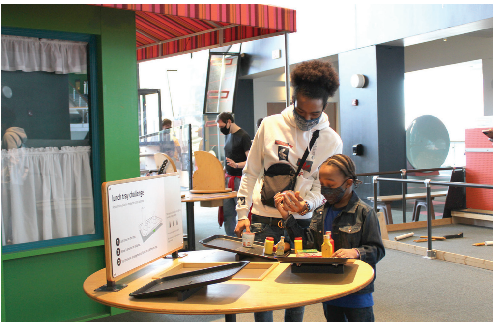
A teen is seen guiding an elementary age student in formulating a healthy lunch at the Maryland Science Center.

“We see this as an investment in our youth by affording them additional opportunities to use and strengthen their intellectual and leadership skills and abilities...”