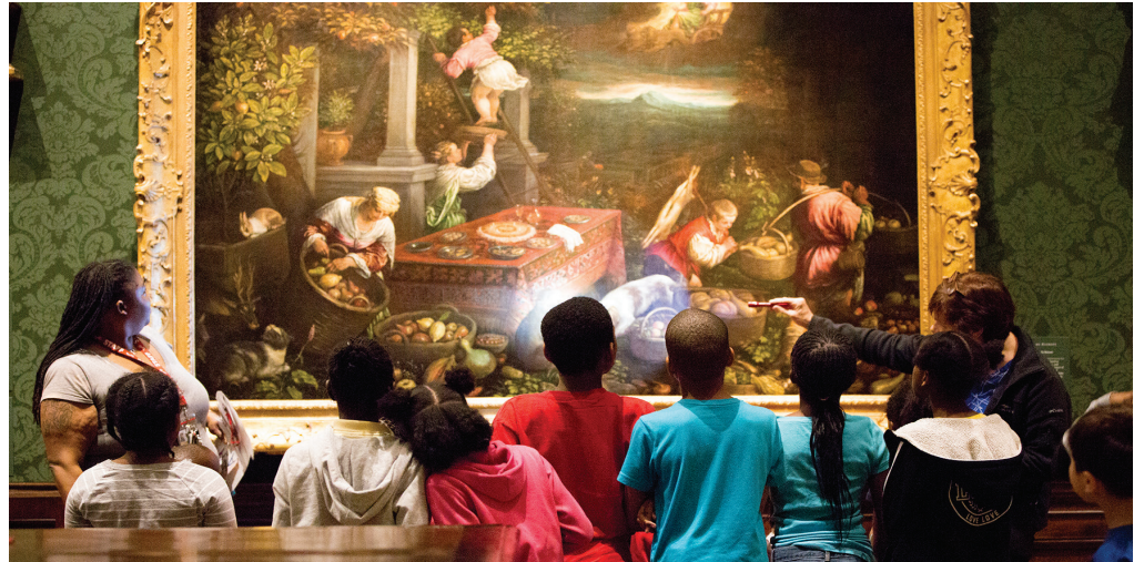
Delaplaine Foundation underwrites the cost of admission for FCPS students to regional museums and galleries. Students seen learning about a painting at Walters Art Museum.

As part of a diverse funding initiative, Delaplaine Foundation has partnered with Junior Achievement of Central Maryland to create financial literacy classes for middle school students. Through the JA Finance Park Virtual Program, class participants use a computer program to simulate “real life” economic situations that factor in education levels, marital status, number of children, etc. Students gain crucial critical-thinking skills by deciding whether to spend or save, and then learn whether those choices lead to wealth generation in a virtual environment. The program exposes