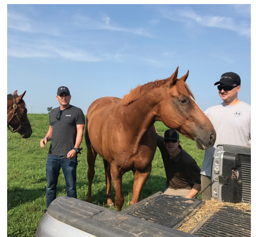
Top: Nationally-known comedian, Sinbad, was one of several acts that military veterans enjoyed at the Weinberg Center. Above: Volunteers assist sanctuary horses at The Foxy G Foundation farm.