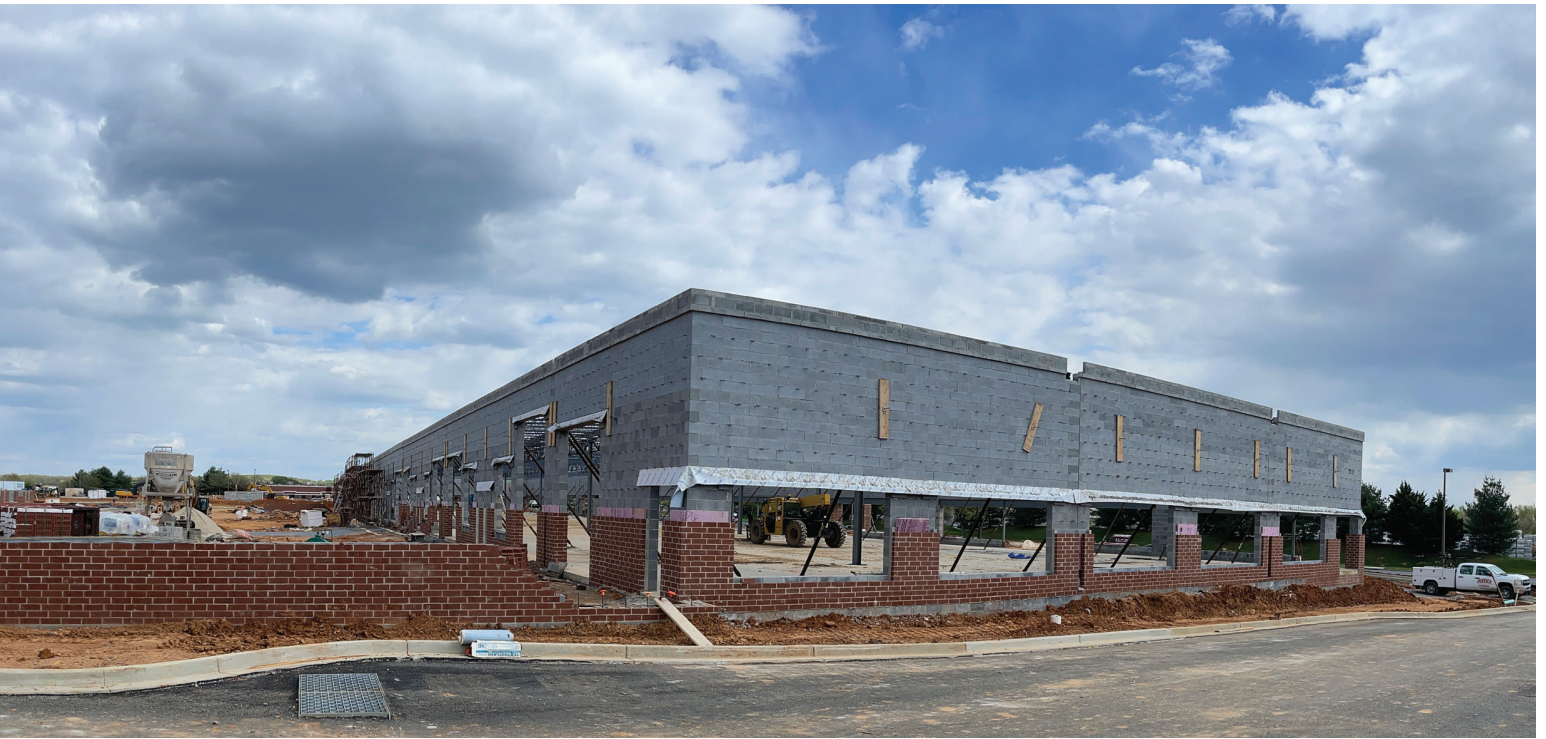
The 36,000 sf building being constructed on Monocacy Boulevard will house the Platoon Veteran's Service Center and serve as the main campus for Goodwill Industries of Monocacy Valley. Completion of the building is slated early in 2022.