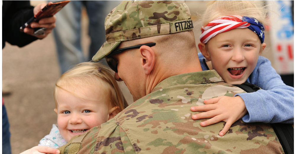
An Army Staff Sergeant hugs his family after returning from a 10-month deployment. Service members will soon have the benefit of newfound local support offered at the Platoon Veteran Services Center.