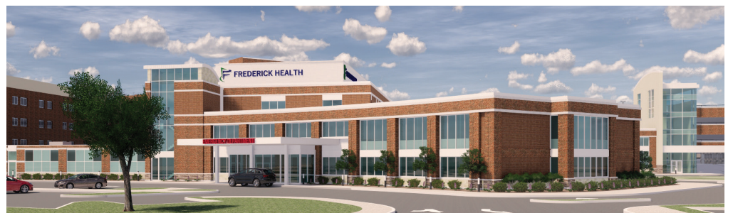
Rendering of campus upon completion of new Critical Care /Emergency departments.